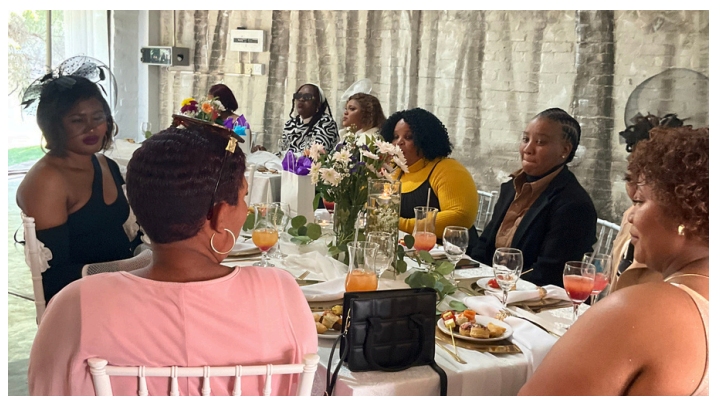
Women of Alkantpan in attendance.

The programme concluded with a vibrant through discussions on balance and self-care, which brought colleagues together in laughter, music and solidarity; a reminder that wellbeing is not only about discipline and learning but also about joy, connection and fellowship.