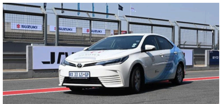
Gerotek at Kyalami Grand Prix Circuit.

The Festival of Motoring allows exhibitors in the automotive industry to showcase their products and services to automotive enthusiasts who come from all corners of South Africa. Visitors get an opportunity to drive in various custom vehicles administered by professional drivers around Kyalami Grand Prix Circuit.