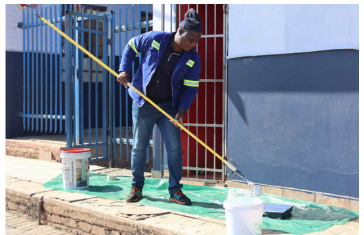
Arm Scor employees repainting classrooms at Meetsing Primary School.

Employees at Armscor Dockyard concluded the drive at Kleinberg Primary School, in the City of Cape Town. The team donated school uniforms and lunch packs to 200 pupils coming from disadvantaged homes. The school principal encouraged the learners not to be disheartened by their situations, "arms of help" are always in various ways and forms. This Mandela Day was a reminder that real change begins with each of us taking action. Together, we can paint brighter futures, empower young minds and support communities in need. Thank you to every volunteer and partner who made this day possible.