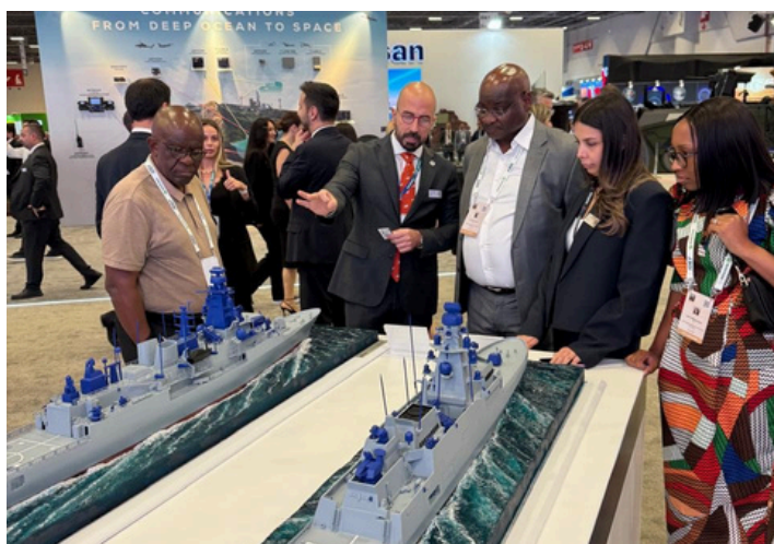
Companies within the South African Defence Industry collaborate to demonstrate their capabilities at the International Defence Industry Fair held in Türkiye.

In an effort to unlock new opportunities and establish international partnerships, Armscor participated at the 17th International Defence Industry Fair (IDEF2025) held at the Istanbul Expo Centre in Türkiye from 22 - 27 July 2025, under the South African National Pavilion. This was organised by the Department of Trade, Industry and Competition (dtic) to showcase its core capabilities; to strengthen bilateral relations by leveraging its position as government delegation; and to support the South African Defence Industry (SADI) in exploiting new markets and opportunities.