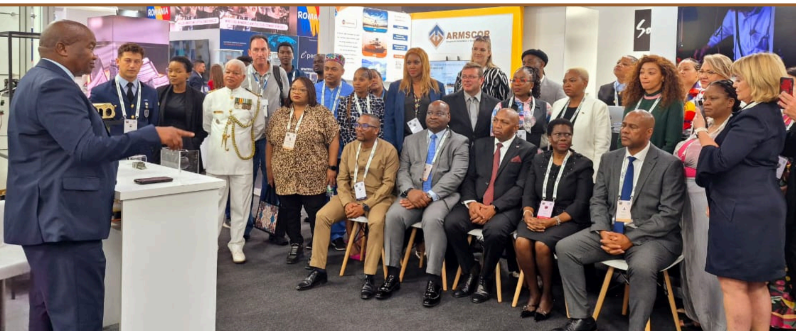
Maj Gen (ret) Bantu Holomisa, Deputy Minister of Defence and Military Veterans lead the South African delegation to the 17th International Defence Industry Fair.

In an effort to unlock new opportunities and establish international partnerships, Armscor participated at the 17th International Defence Industry Fair (IDEF2025) held at the Istanbul Expo Centre in Türkiye from 22 - 27 July 2025, under the South African National Pavilion. This was organised by the Department of Trade, Industry and Competition (dtic) to showcase its core capabilities; to strengthen bilateral relations by leveraging its position as government delegation; and to support the South African Defence Industry (SADI) in exploiting new markets and opportunities.