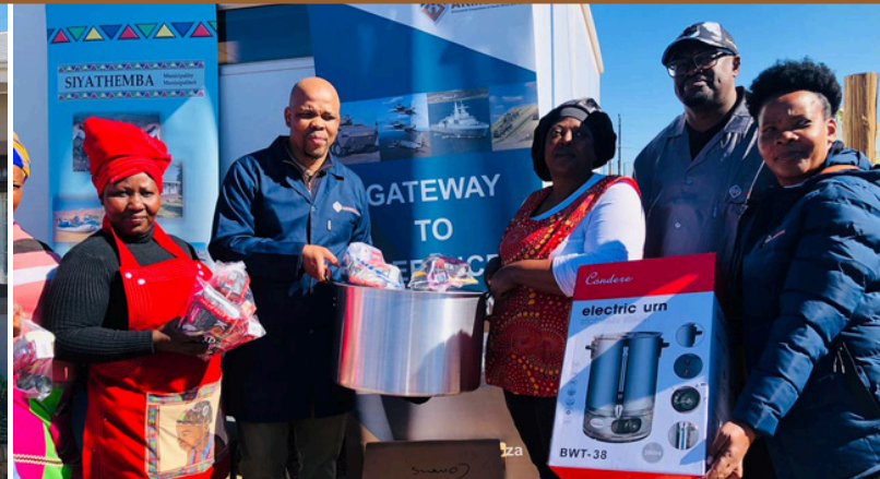
Employees at Alkantpan Test Range donate blankets and kitchen equipments as part of Nelson Mandela Day outreach programme.

In the true spirit of Nelson Mandela's legacy of service, compassion and unity, on 18 July 2025, Armscor employees came together to create meaningful change in various communities throughout the country. Guided by the ethos of "67 Minutes for Madiba," employees dedicated their time and resources towards a good cause. Armscor facilities participated as follows: