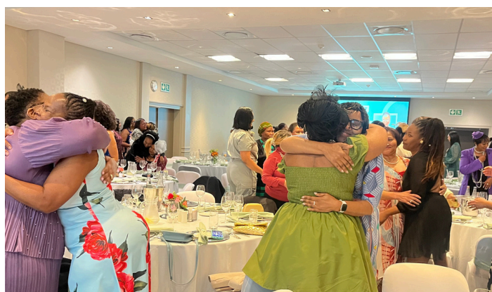
The "You Are Okay" feature.

From Pretoria to Prieska and Cape Town, the series demonstrated that when women are celebrated, supported and empowered, the entire organisation benefits. The Women of Impact sessions have left a legacy of pride, unity and growth.